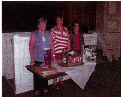
Raffle Prize Winners