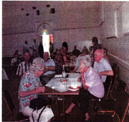
Friends of the Gallery enjoying Morning Tea